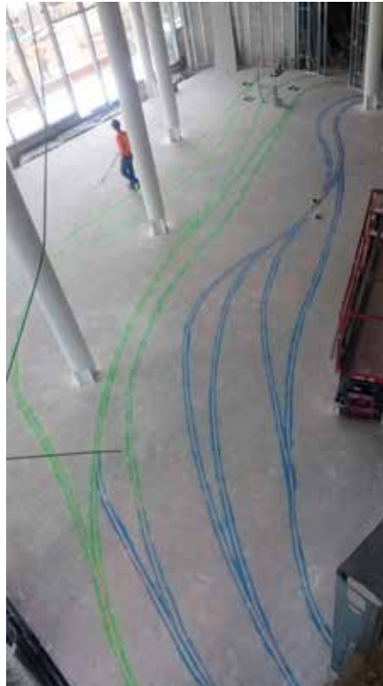
Layout complex shapes quickly and accurately