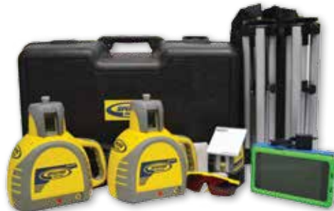
The QML800 all-inclusive package consists of 2 lasers, 2 tripods with canvas bag, Nexus controller, LP30 pointer and beam interceptor, chargers, laser enhancement glasses, carrying case and instructions

Each Spectra Precision product is built with the user in mind. That is why we test and retest every laser we manufacture to assure you the most dependable, accurate laser in the world. Backed by the world's largest network of repair centers, Spectra Precision is unmatched for service, support and dependability.